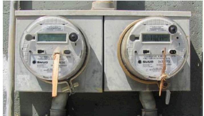
Figure 1 – Example of Attempted Power Theft

The objectives of the software implementation were twofold: 1) SMUD moved from a reactive to a proactive approach for identifying theft. This was a natural outgrowth of the AMI project since the periodic visual inspections were abandoned along with the manual